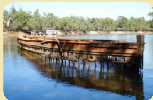
Their hulls now resting at Mansell's Reserve

Today, both hulls rest quietly at Mansell's Reserve, a reminder of the river's rich history and the paddle steamers that once powered it.